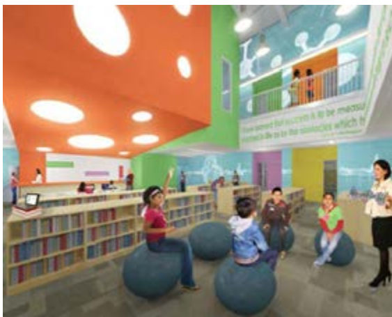
DoDEA Elementary School Learning Centers

This course did an excellent job of presenting core concepts of DoDEA’s 21st Century Education, how facility design responds to those ideas, the Design Center approach to shared creativity and standardization, and how the school facility is actually used for education and enrichment of students. The entire slide deck and a recorded presentation are available at same.org/apc .