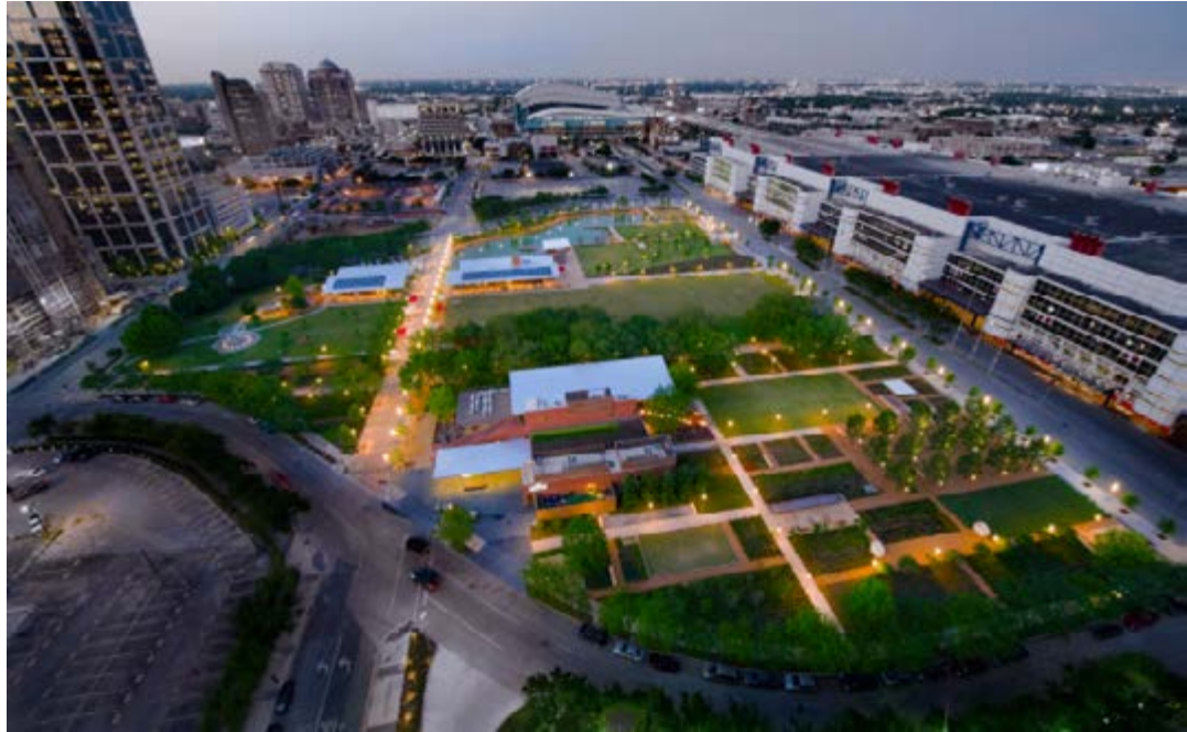
Discovery Green downtown Park adjacent to the George R. Brown Convention Center (left)

“Mystree” and playground, Solar photovoltaic and water heating collectors, Administration building with real time energy display, Interactive fountain and pump room, Lakehouse with library and green room uses, Amphitheater as garage cover, Le Phantom by Jean Dubuffet, Garage lobby and vehicle ramp. The tour will focus on design effectiveness and system integration. Plan for at least 45 minutes for the walking portion of the tour, until 12:30, but Page can make it an hour or longer if that time is available in the conference agenda. The presentation and tour is available for AIA CEU credit and we’ll have appropriate paperwork for those interested in getting Continuing Education credit.