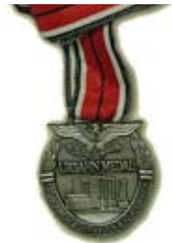
SAME Urbahn Medal. Since 1997.