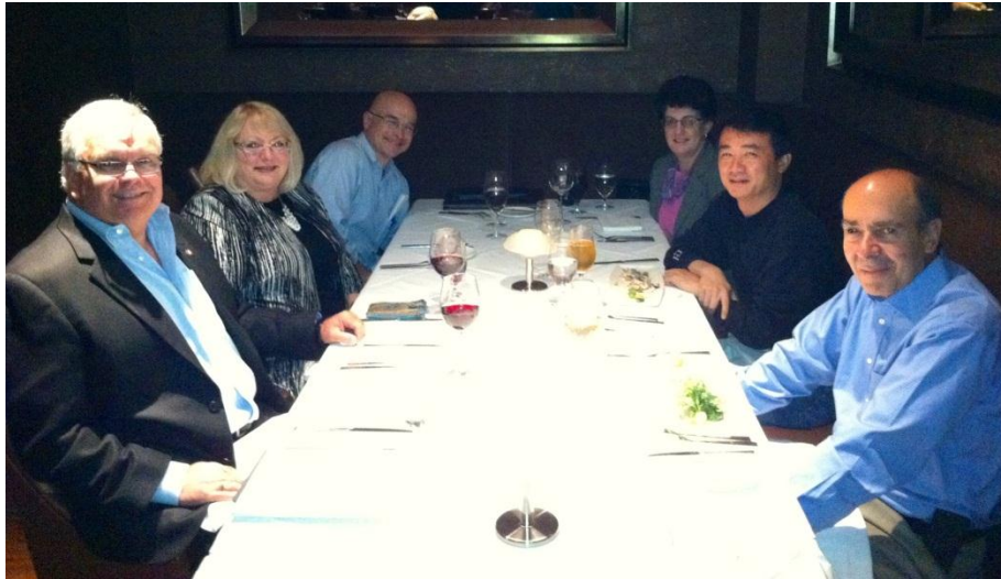
APC Leadership gathering in Alexandria, VA