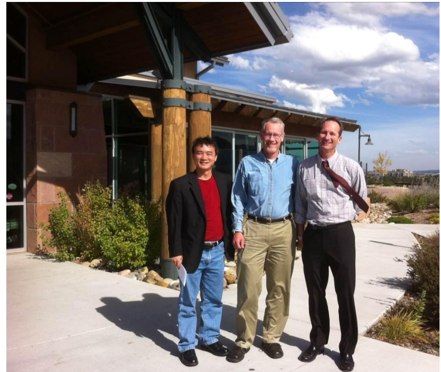
Meeting with Pike's Peak post POC