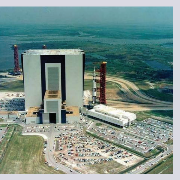
The Saturn V 500F rocket rolls out of the Vehicle Assembly Building (VAB) on May 25, 1966 at NASA's Kennedy Space Center in Cape Canaveral, Fla.