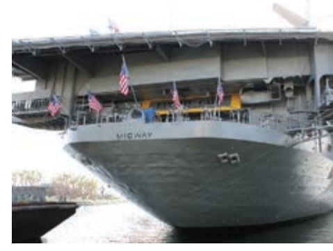
2013 JETC conference ice breaker and social event at USS Midway, San Diego harbor.

POC and communicate your interests through them or to each Vice Chair directly.