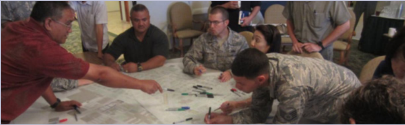
Case Studies – Joint Base Pearl Harbor-Hickam, 12 Workshops, 25 months, 420 Participants