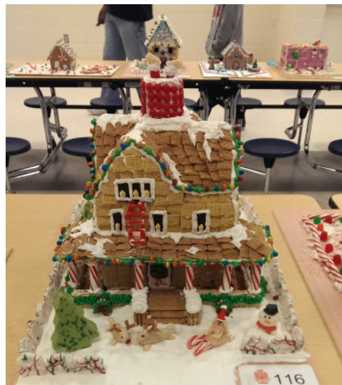
Far Right: Best Roof Winner Right: Most Sustainable Winner