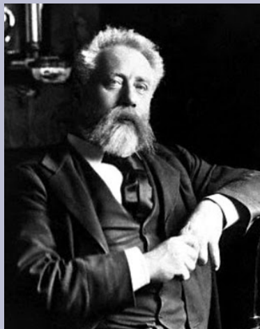
William Earnest Henley

Quote by William Earnest Henley. Take time to guide your own path and undertake what is important to you. Good luck in 2014!