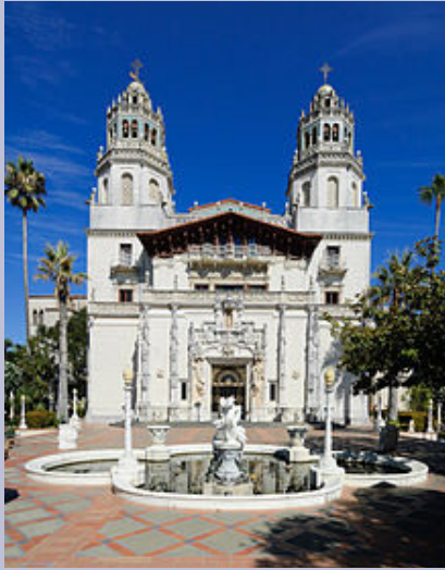
Hearst Castle Facade San Simeon, California