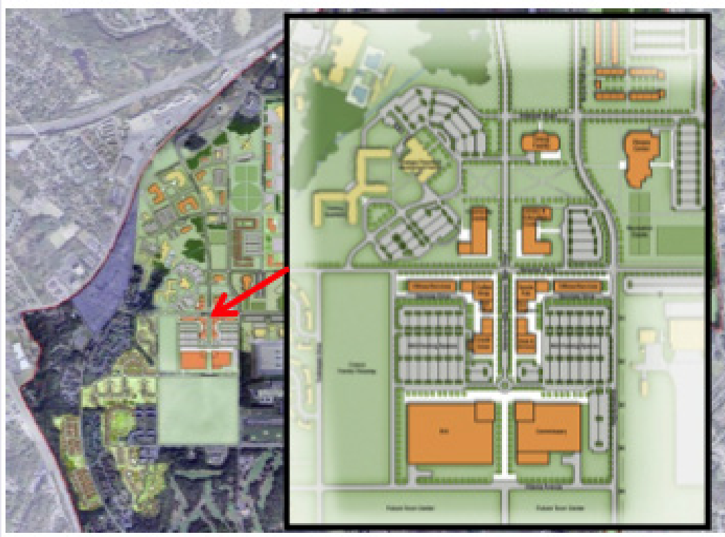
Andrews AFB was redesigned to provide compact nodes with shared parking.

Conclusion. Even though an installation is very similar to a small city, the installation plays a larger role. The installation serves as a launching and training platform for warfighters and weapon systems. An installation keeps the family safe so the soldier can concentrate on his/her job. Good planning helps establish the installation as an effective, efficient system that when done well is as vital to the fight as more traditional weapon systems. It is our job to provide the most efficient, effective, sustainable system we can to the war fighter and their families. APC