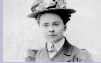
Julia Morgan (1872 - 1957)