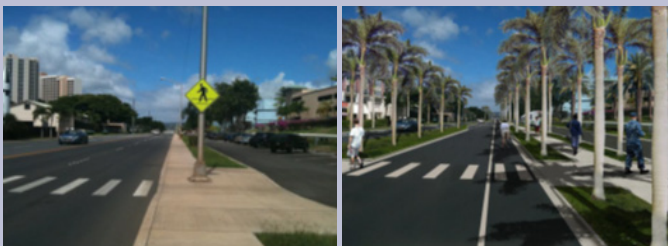
Sustainable Planning - Transit-Oriented

As in the past, the entire presentation is available on the APC webpage.