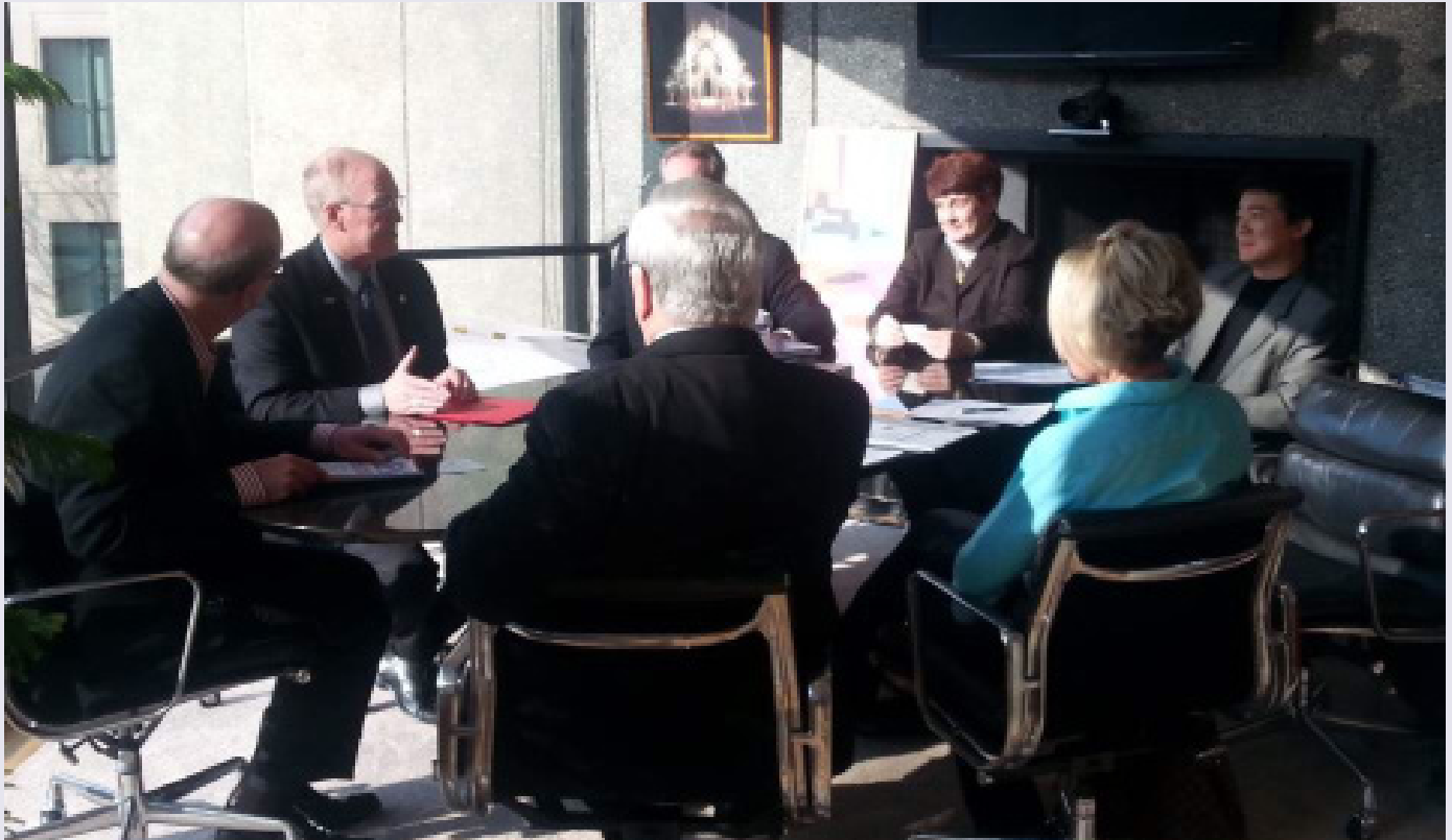
SAME APC meets with AIA National to sign the MOA