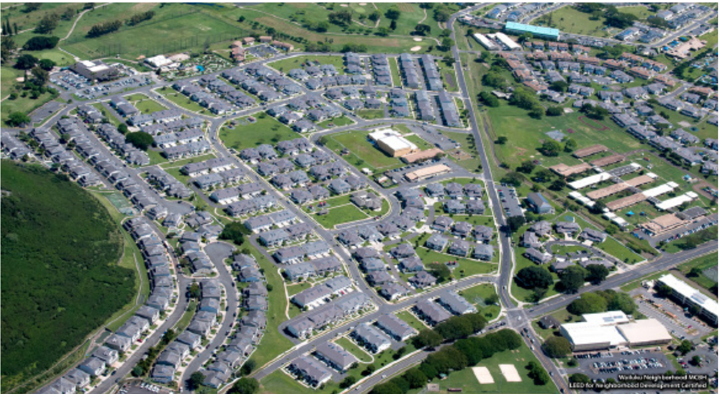
1st Military Neighborhood certified to LEED ND – Hawaii

housing managers, and some of the nation's leading design, development, construction and financial institutions. He is responsible for development, acquisition, execution, design and construction, oversight, monitoring and management of public-private venture housing portfolios supporting the Navy and Marine Corps. The Department of the Navy's investment portfolios currently includes over 40 projects with a total asset value of approximately $10 billion. This is the program that has transformed Department of the Navy housing into the modern, well-maintained and operated communities that service members and their families rely upon today. New and renovated homes enhance the quality of life for service members and their families and each neighborhood supports families with community centers and