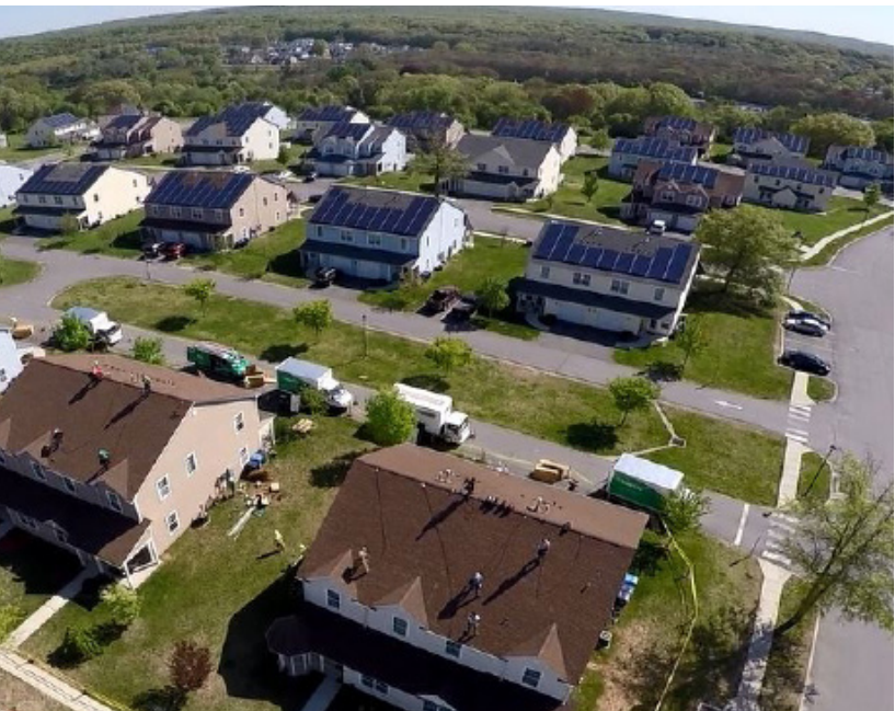
Dolphin Gardens, Navy Northeast Housing w/Solar Panels