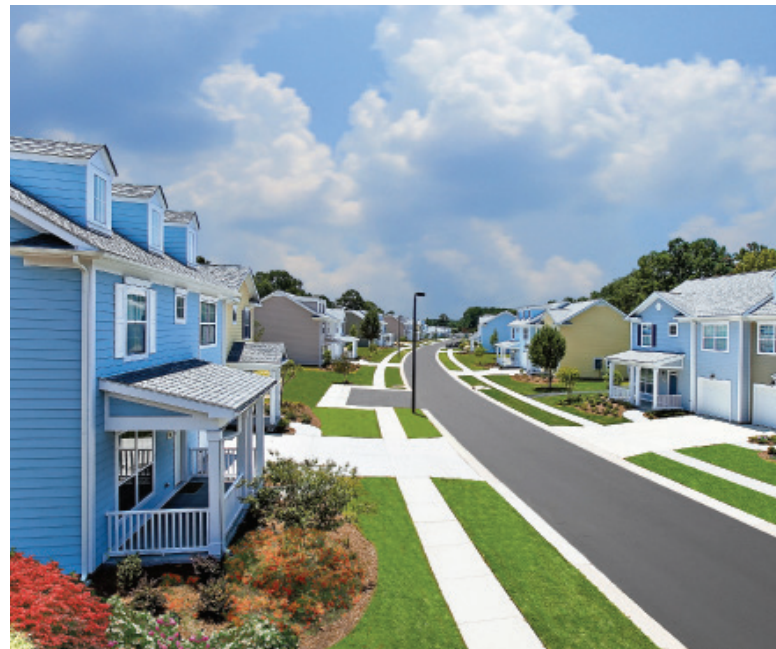
Navy Housing Charleston, SC

recreation facilities, including tot lots for small children, youth centers, swimming pools, playing courts and schools. All improvements enhance the community in general and foster camaraderie during periods of long deployments. Since the inception of this program resident satisfaction, as measured by independent surveys, has climbed from 68.4 (Below Average) to 82.6 (Very Good).