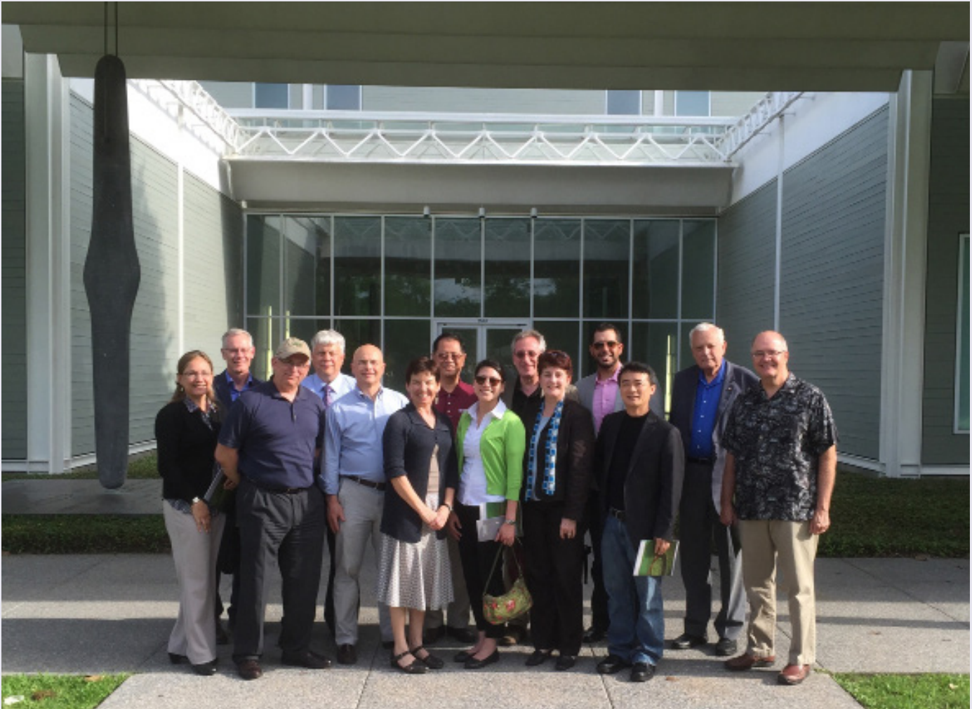
SAME APC at the Menil Museum in Houston, JETC 2015

have been sharing information and opportunities, and promoted common goals for the advancement of the profession, including “growing the tent” of public architecture and increasing its exposure beyond the constituencies of AIA and SAME.