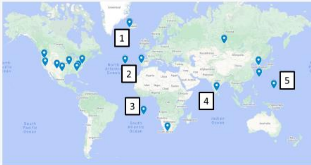
World Map of Remote Location Online Students