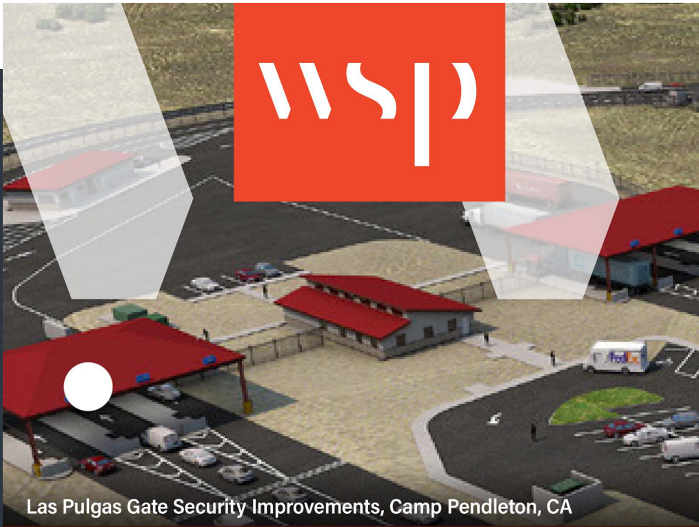
Las Pulgas Gate Security Improvements, Camp Pendleton, CA