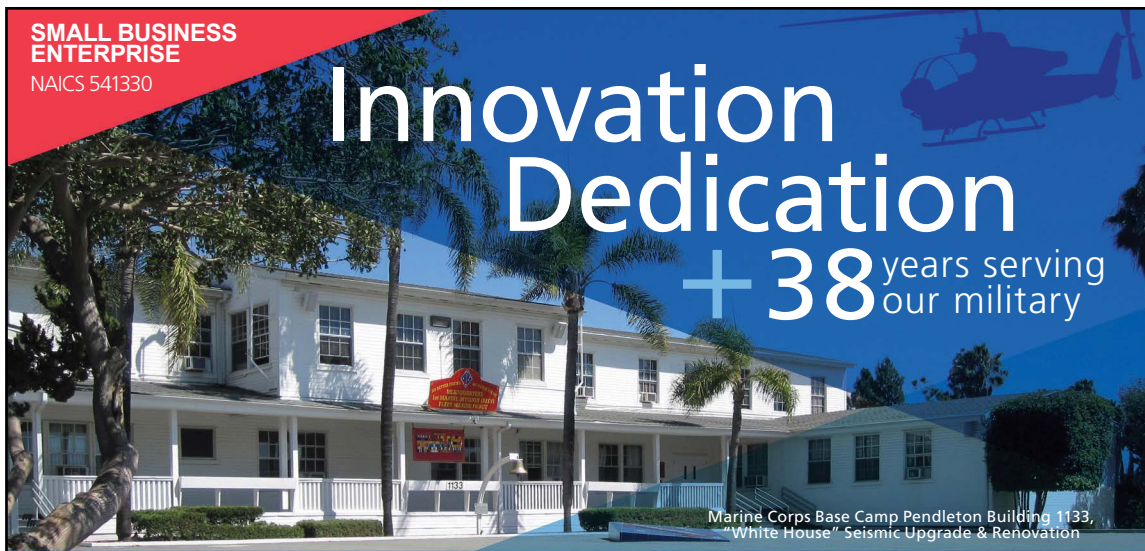
Marine Corps Base Camp Pendleton Building 1133, "White House" Seismic Upgrade & Renovation