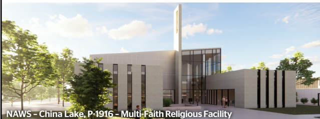
NAWS - China Lake, P-1916 - Multi-Faith Religious Facility

Proud to Support SAME Camp Pendleton Day!