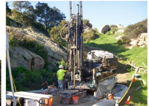
Drilling groundwater monitoring well

https://www.spl.usace.army.mil/Business-With-Us/Small-Business-Program