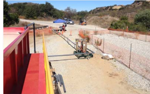
Groundwater cleanup operations

Los Angeles District: www.sam.gov W075W075 ENDIST LOS ANGELES