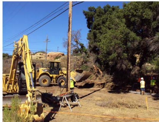
Soil cleanup operations