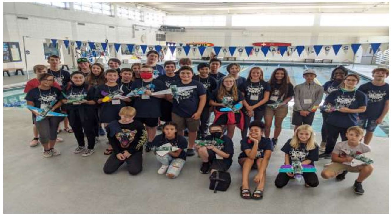
Week two GCSC 8th-10th grade STEM camp final project Sea Gliders assembled after successful test

traverse an Olympic size swimming pool. They learned cyber security (next year's camps will have an airborne remote-control drone, with cyber security required, with teams attempting to 'hack' as other teams navigate their drones) both hacking and the importance of good cyber security. The majority of students indicated that they desired to attend the 2021 sessions.