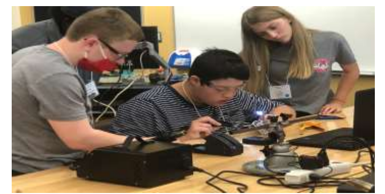
Students soldiering parts of their Sea Glider Kit as part of GCSC 8th-10th grade STEM camp project

Instilling an interest in science, technology, engineering and math in the minds of middle and high school students. Giving those students skills they need to excel and confidence to strive along with tools they need to get into competitive STEM careers.