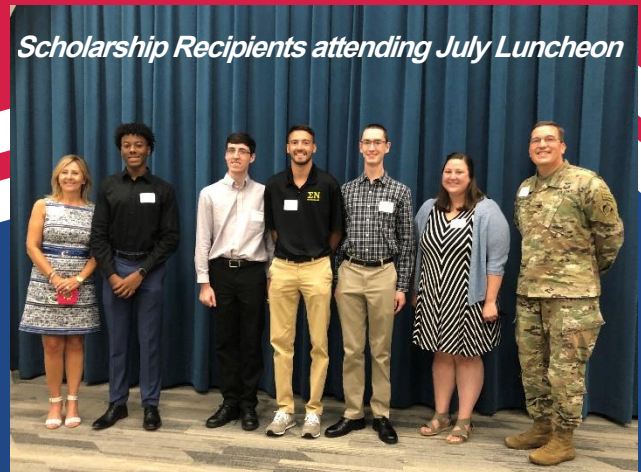
Scholarship Recipients attending July Luncheon