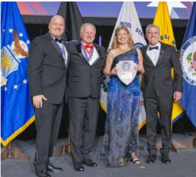
Post SM Pond & Company Receives Seymour Greenfield Corporate Award