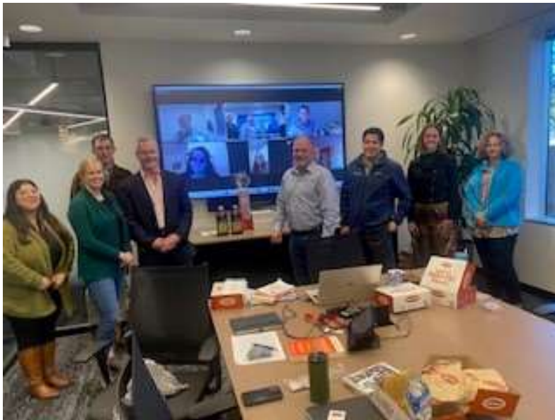
Post LLAB Session

We are now accepting applications until July 19 for the 2024-2025 San Antonio Post Leadership Lab (LLAB). Our LLAB is the oldest leader development program (LDP) in SAME and is the model that SAME used to build its LDP. Over the course of 7 months, selected participants will develop strong relationships, build leadership qualities, and enhance professional growth through discussions and engagement on conflict resolution, communication skills, and mentorship. This is a highly desirable program that allows you to engage with local leaders throughout the San Antonio community. This program is open to all San Antonio Post members and our field chapters. If selected, this is a 7 month commitment to your team, meeting in-person or virtually (if not local) for two hours, 1-2 Mondays a month. Lunch is provided by our amazing host companies. Previous leadership classes included engineers, architects, business developers, project managers, estimators, and more. You can find the application at https://www.same.org/wp-content/uploads/2024/05/2024llab.pdf and more information about our LLAB at https://www.same.org/san-antonio/post-leadership-lab/ or you can reach out to Course Co-Directors Cathy Bond at cbond@boldconcepts.com and Cade Deines at cdeines@hidcapital.com .