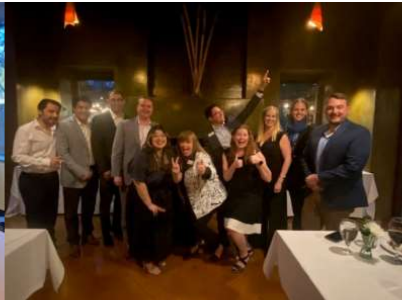
Post LLAB Graduation

(Preview the LLAB Application on the next pages)