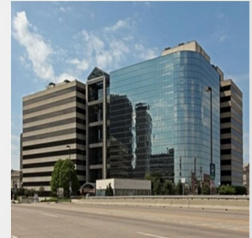
(Pictured: GSA Region 6, Two Pershing Square, KCMO)

The Public Buildings Service is the landlord for the civilian Federal Government. PBS manages over 370 million rentable square feet of workspace for federal employees, owns 1,600 plus assets totaling over 180 million rentable square feet, and manages 7,000 plus leased assets totaling over 180 million rentable square feet. The rent federal agencies pay is the major source of funding.