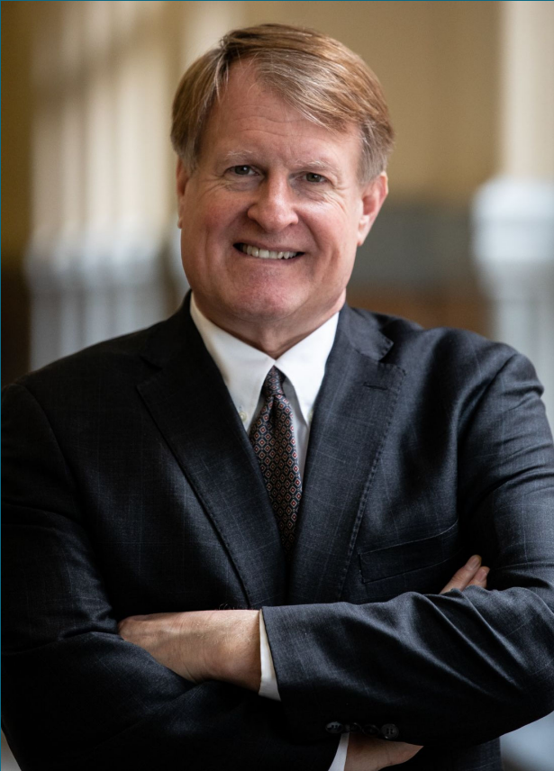
Former County Executive Rich Fitzgerald