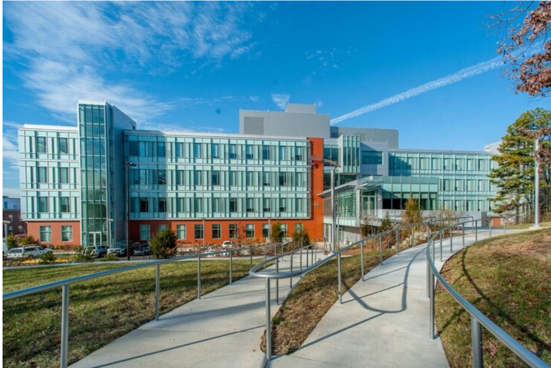
NASA Goddard Space Flight Center