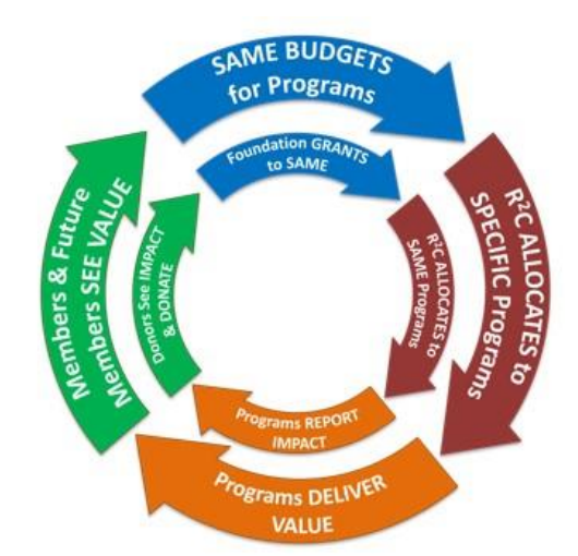
Figure 1: Foundation Donor & Society Impact Cycles