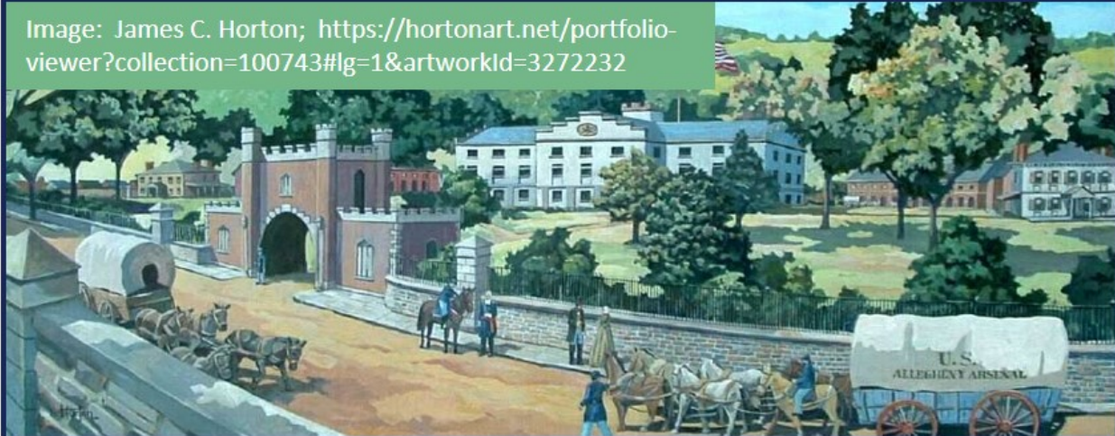
Image: James C. Horton; https://hortonart.net/portfolio-viewer?collection=100743#lg=1&artworkId=3272232