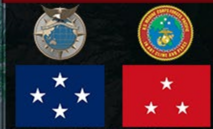
Camp Smith, Halawa Heights