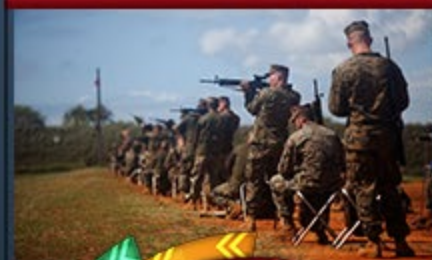
Pu'uloa Range Training Facility, Ewa Beach