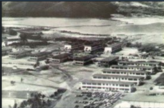
NAS Kaneohe Pre-1940