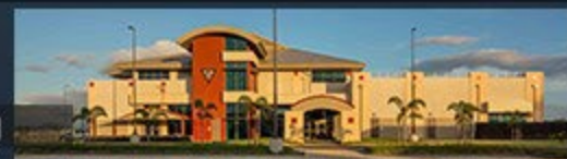
MCAS OPS Bldg

Note NAS Kaneohe in the late 1930s and compare it to modern day MCBH Kaneohe Bay – very similar, as much of the infrastructure remains and is still being used.