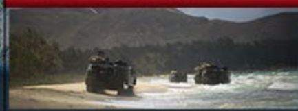
Marine Corps Training Area Bellows