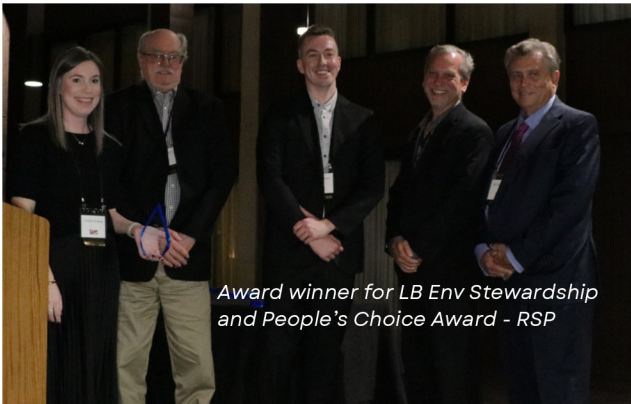
Award winner for LB Env Stewardship and People's Choice Award - RSP