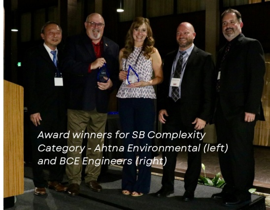
Award winners for SB Complexity Category - Ahtna Environmental (left) and BCE Engineers (right)