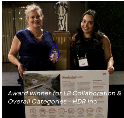
Award winner for LB Collaboration & Overall Categories - HDR Inc