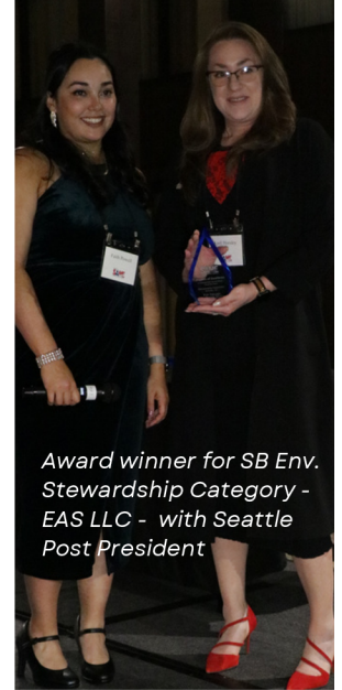
Award winner for SB Env Stewardship Category - EAS LLC - with Seattle Post President