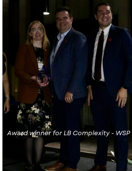
Award winner for LB Complexity - WSP