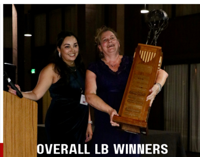
OVERALL LB WINNERS HDR INC