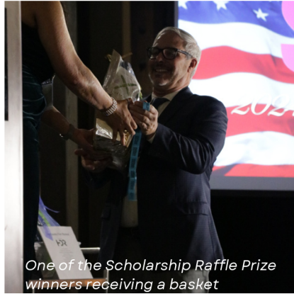
One of the Scholarship Raffle Prize winners receiving a basket