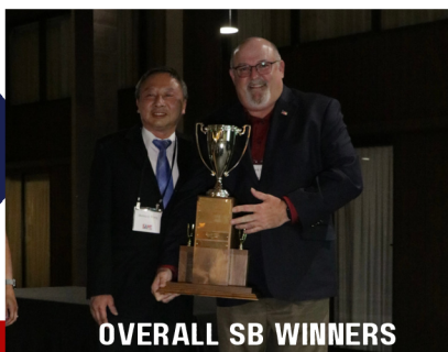
OVERALL SB WINNERS AHTNA ENVIRONMENTAL

Small Business: BCE Engineers for McChord Fire House Repair